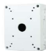
811 Junction Box