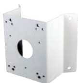
A35 Corner Mount