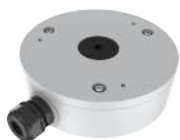
TC-P54BM Spec: V1 Junction Box