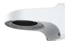
A28 Wall Mount