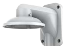
A25 Corner/Pole Mount