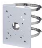
A36 Pole Mount